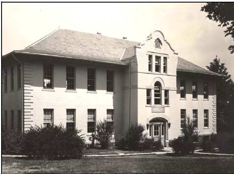
University of Arkansas School of Law, 1940.

ones. They all were serious about getting as much education as they could handle. 8